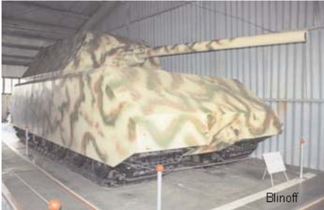
Yes, we'll see the awesome German Maus tank at Kubinka Tank Museum